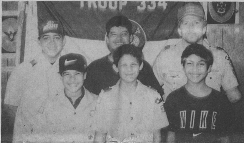
Scout Troop 334 Eagles recently brought home second place in a recent Brahman District basketball tournament.